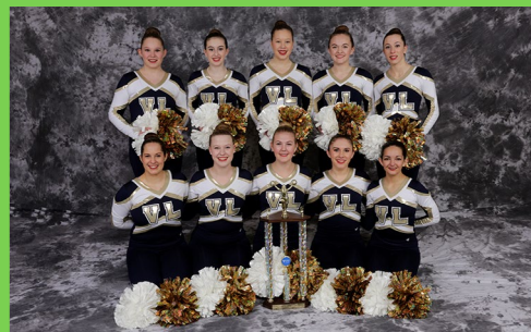
Valley Lutheran - Class C-D