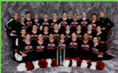
Divine Child - Class B