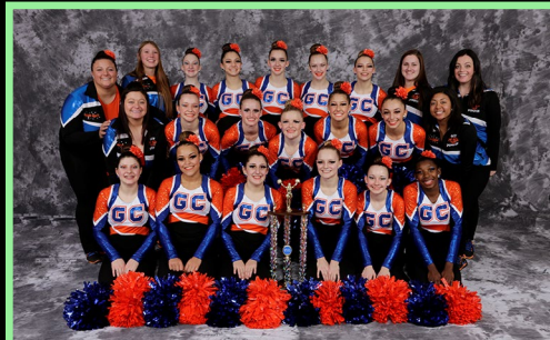
Garden City - Class A