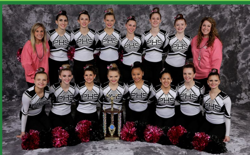
Plymouth - JV