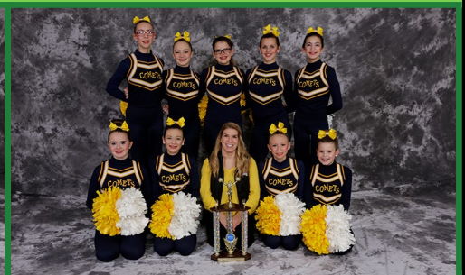
Grand Ledge - Middle School Division II