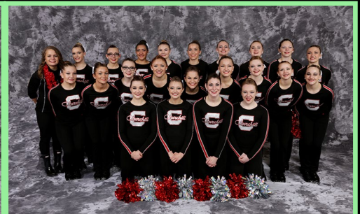
Churchill - Class A Division II